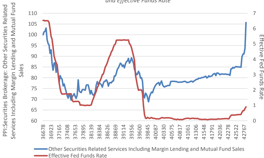
Producer Price of Other Securities Related Services Including Margin Lending and Mutual Fund Sales and Effective Funds Rate

What is causing this spike? We noticed that some producer pricing in parts of the brokerage world have spiked dramatically. We did our due diligence and made sure the statistic was correct from the BLS and we reached out to our contacts in the securities industry, but no definitive answers yet. Although much of this pricing is caused by interest rates, it does not explain this recent pop. Could the implications on Wall Street profits and therefore hiring be as dramatic?